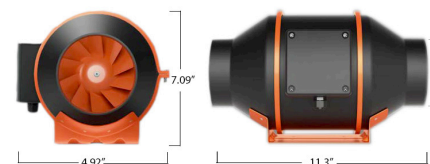
Spider Farmer Blower