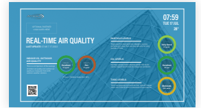
IAQ Lobbyview Dashboard